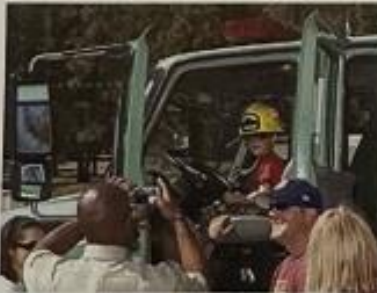
Kids Love This Event