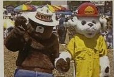
Bring Your Family & Friends