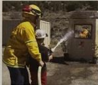
JR Firefighter Challenge