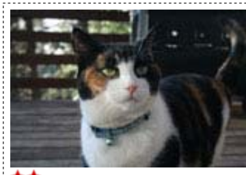
LOST CAT at top of Valle - Drive. She went missing on 1/13/10 Indoor cat, very friendly, never been outside. White w/orange & black. Reward. Please call 522-4971 or 338-5100

RIMOFTHEWORLD.net - Columns http://www.rimoftheworld.net/4718