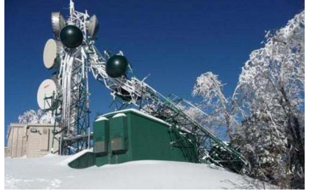
A microwave communications tower located off Playground Drive in Crestline collapsed during the recent storm.

Crestline, CA - Mountain residents who have been experiencing problems with their cell service won't have to wait any longer to know what happened. But they may have to wait a while for service to be restored.