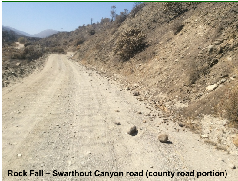
Rock Fall – Swarthout Canyon road (county road portion)