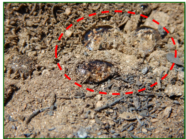
Figure 1: Strong soil water repellency