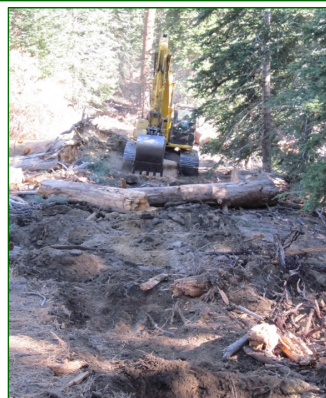
Above: Chunking with an excavator along a dozer line. After chunking, then the equipment spread topsoil and slash from the dozer piles over the treated area.

Success Story – Turtle Fire: After the 1999 Turtle Fire, which occurred in the west end of Baldy Mesa, the Forest was able to control off road use with a combination of both fencing, chunking, and patrols. This was done with fire dozers, the forest sweco trail dozer and contracted excavators. The Blue Cut Fire of 2001, which burned in the same general location as the North Fire, used contracted excavators to rehabilitate dozer line and unauthorized OHV trail impacts within the burn area. The excavators were able to create bank turns on rehabbed chunked lines at road junctions to redirect the recreational public and protect the resources. These “banked turns” replaced the use of fence on many of the interfaced points.